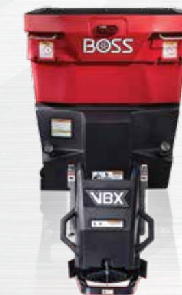
VBX 8000 2 cubic yards of capacity