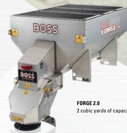
FORGE 2.0 2 cubic yards of capacity

*All images shown may include standard/optional equipment. Please consult your local BOSS Dealer for more information.