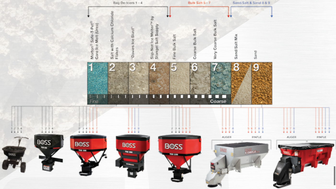
NOTE: Assumes Dry, Free-Flowing Material