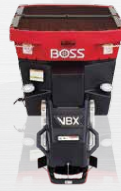
VBX 6500 1.5 cubic yards of capacity